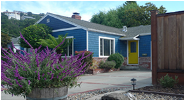
131 Molton Avenue, San Carlos