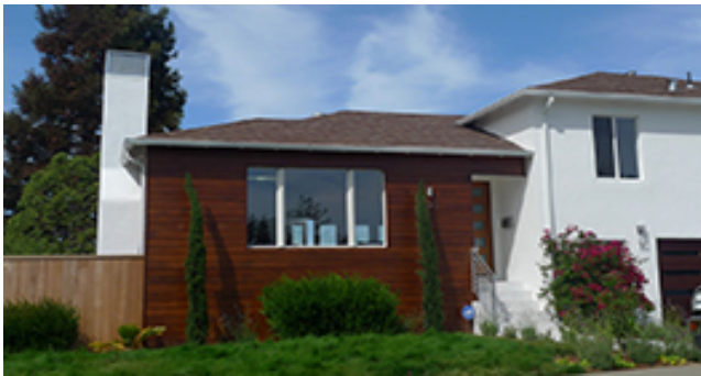
125 Chestnut Street, San Carlos