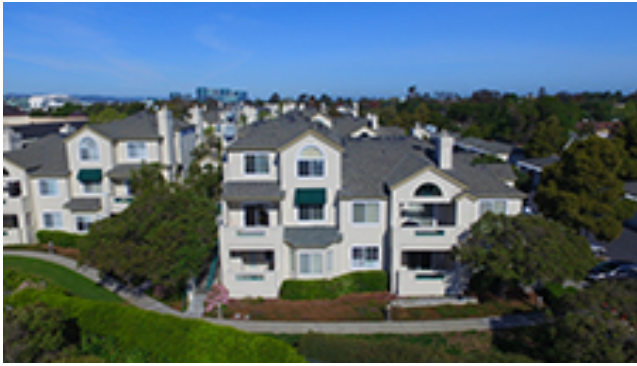
2904 Hastings Shore, Redwood Shores